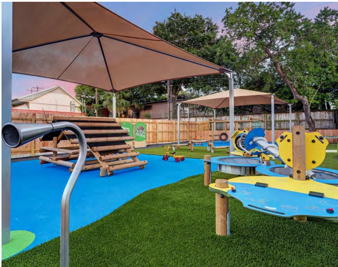
Kido, Rice Village

"A lovely, clean space to enrich the students learning, and absolutely incredible and friendly staff. We feel so lucky to have found such an amazing preschool for our little one. I would highly recommend it. Outstanding!"